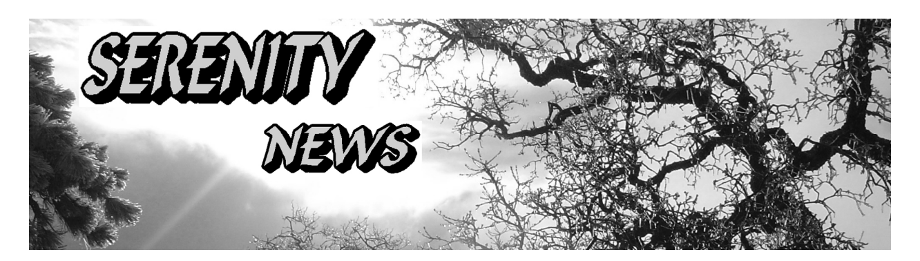
"Don't let the noise of others' opinions drown out your own inner voice."