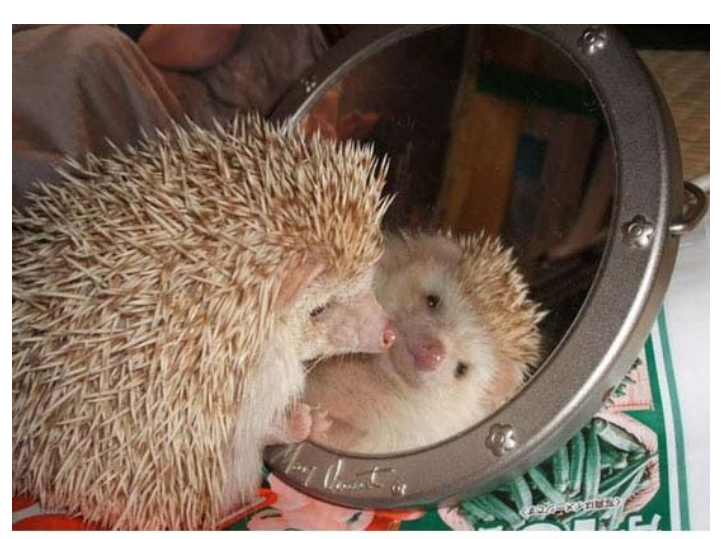
more cute stuff at JUSTCUTEANIMALS.COM