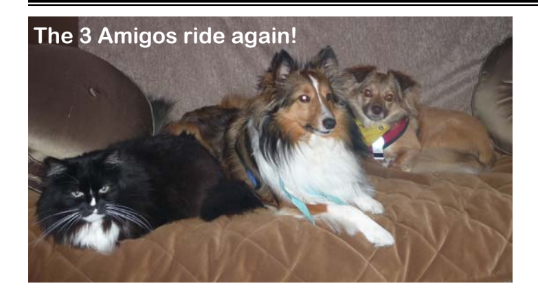
ISSUE # 40, AUG 2011—OCT 2011