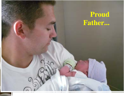
...and that's just the first stop, Eugene OR.